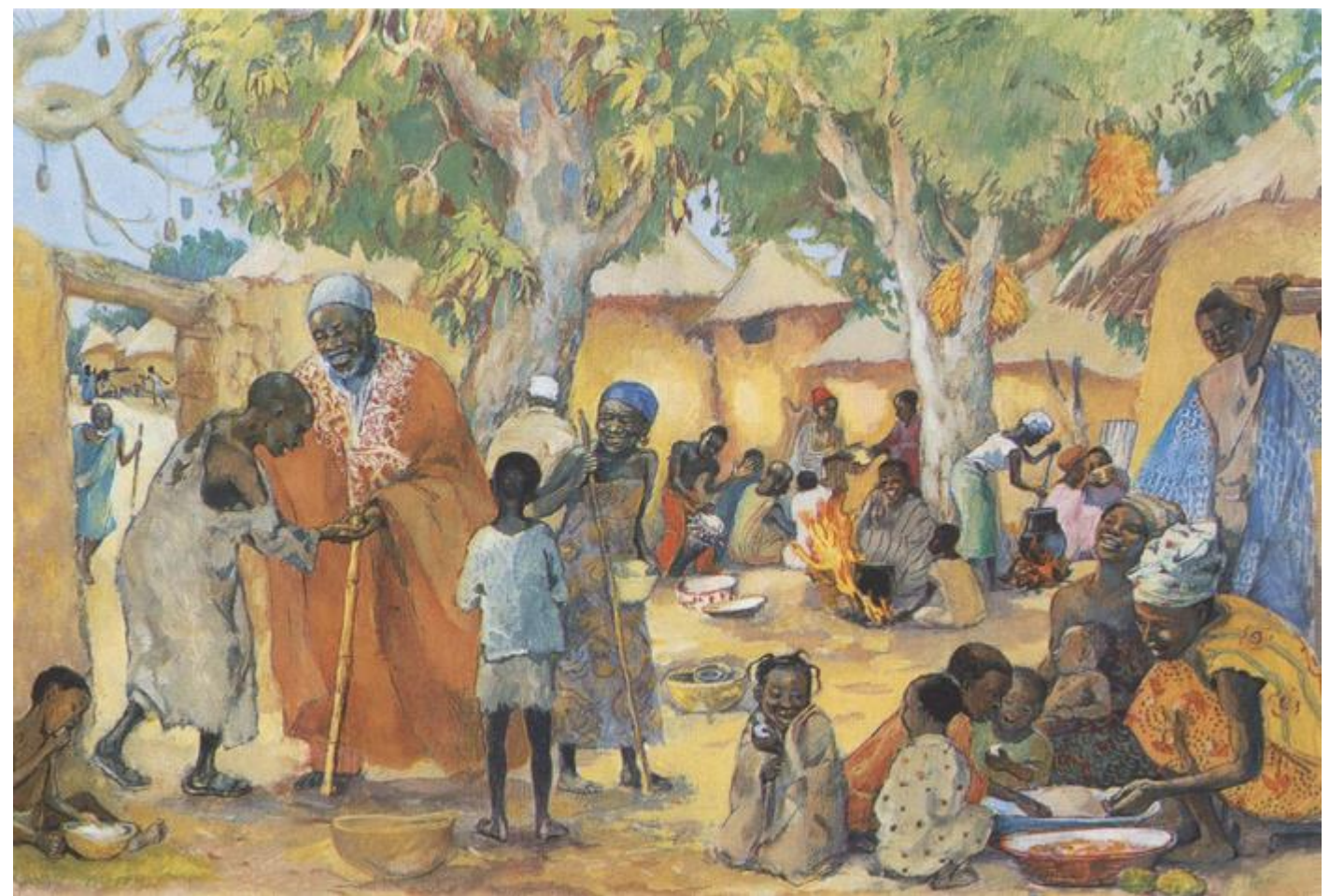
JESUS MAFA. The poor invited to the feast, from Art in the Christian Tradition , a project of the Vanderbilt Divinity Library, Nashville, TN.