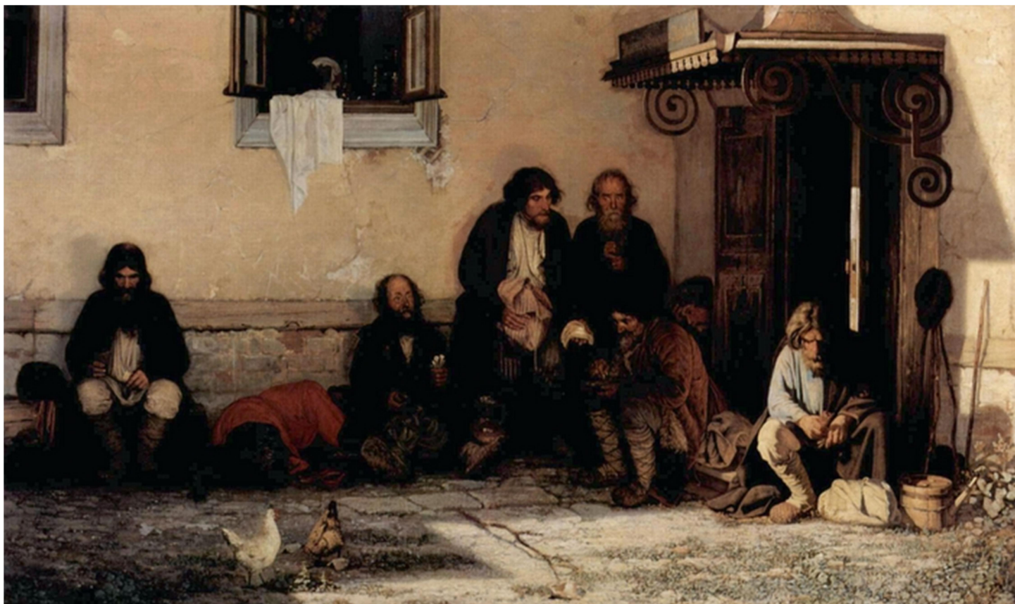
Painting by Grigoriy Grigorievich Myasoyedov (1834 – 1911). Image in the public domain.